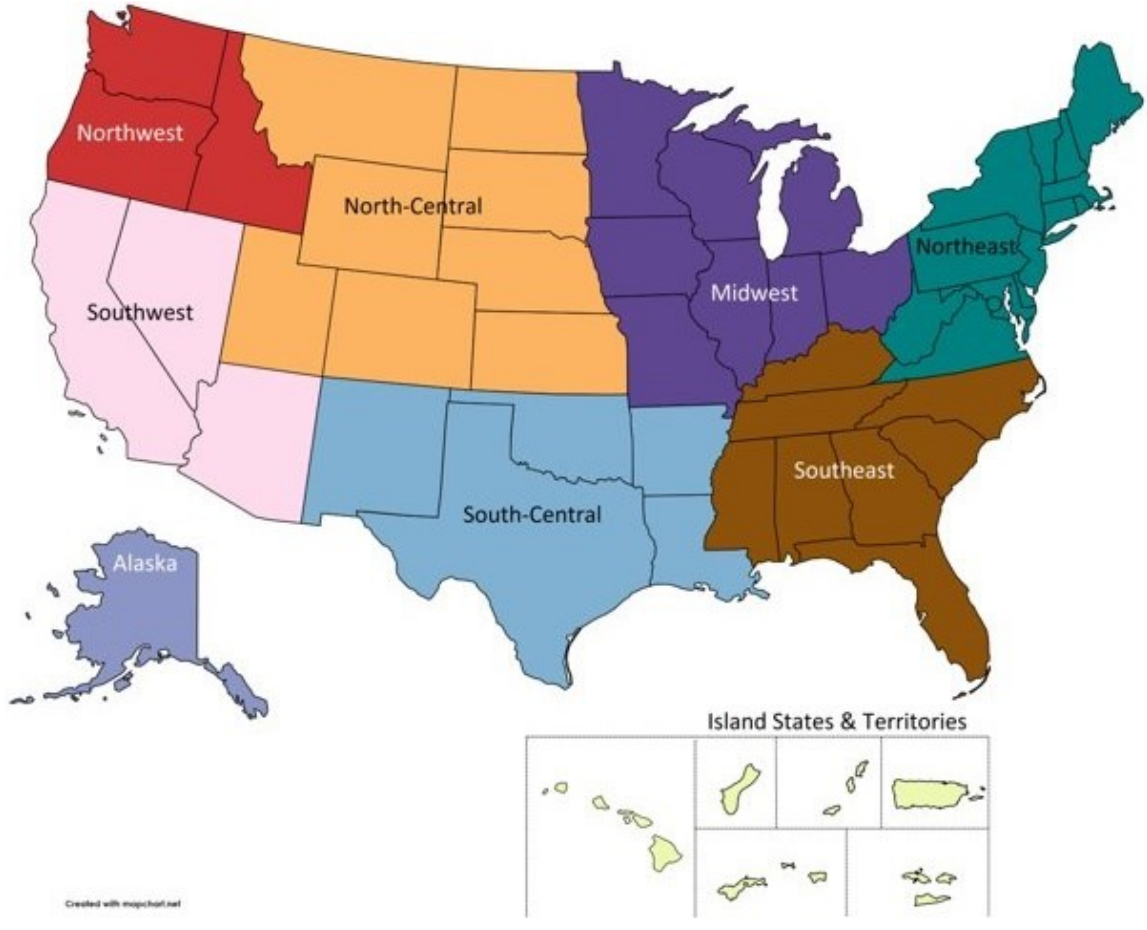
Figure 1. Regions of Interest Map

<u>Table 2</u> below includes potential energy and climate challenges by region, and corresponding example energy technology solutions. Applicants should consider the energy challenges and technologies in this table, but this table is not exhaustive. OCED also welcomes proposals on risks, challenges, and energy technology solutions outside these lists which meet the topic area requirements outlined in <u>Section 2.2.2</u>. The Region(s) of Interest should be the location of the rural or remote area(s) that will benefit from the project.